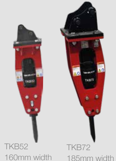
TKB52 160mm width