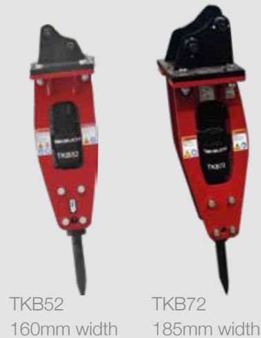
TKB52 160mm width