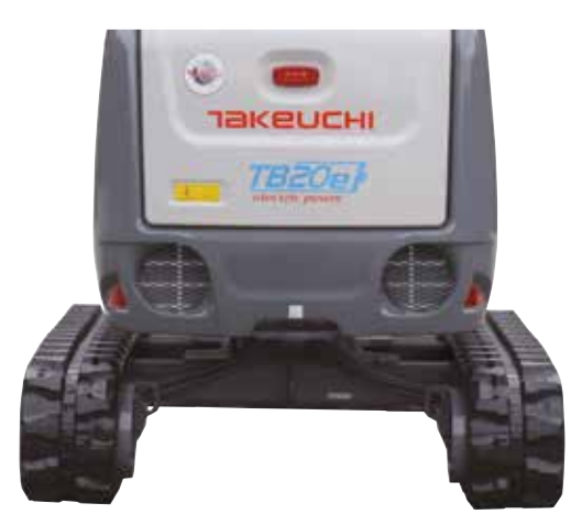
Expanding undercarriage 980-1300mm