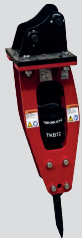
TKB72 185mm width