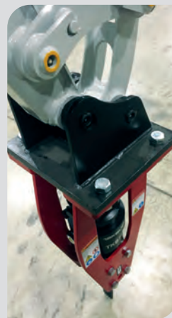
TKB52 160mm width

The TKB52 and TKB72 are designed for narrow trench work, offering operators enhanced visibility directly into the trench. This is vital for sensitive utilities work.